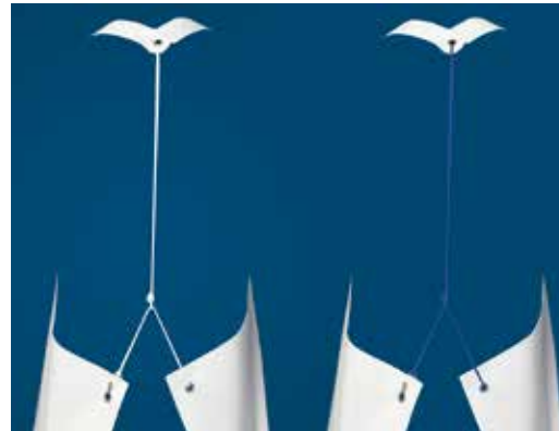
Y-shaped harness with neck strain relief (blue or white)