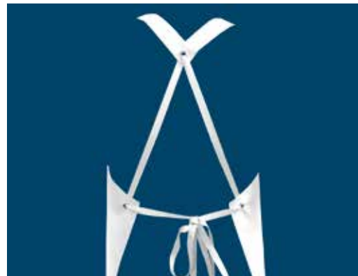
X-shaped harness made of hygienic apron material